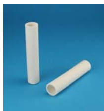
AR5000(14-0015/14-0029) Ceramic Ash Insert 10 Pack