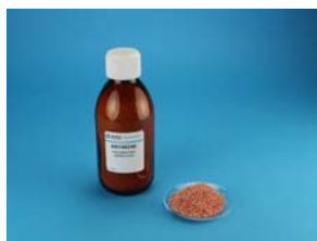
AR140246(14-0246) - 470g High Reduction Copper Sticks