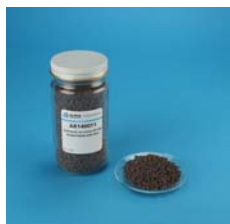
AR140011(14-0011) - 100g HT Combustion Catalyst