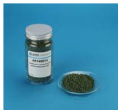
AR140014(14-0014) - 50g LT Combustion Catalyst