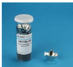
AR2186-200(14-0017) - 200Pcs Tin Foil Cups 36x36mm