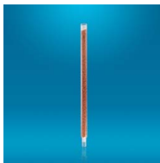
AR140226(14-0245) Pre-Packed Reduction Tube